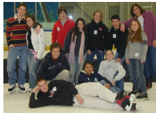
Tween-teen themed-skate nights