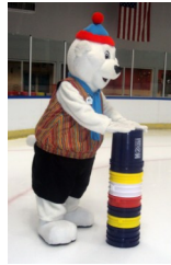
Skate helpers for beginning skaters