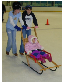
Sleds for small children